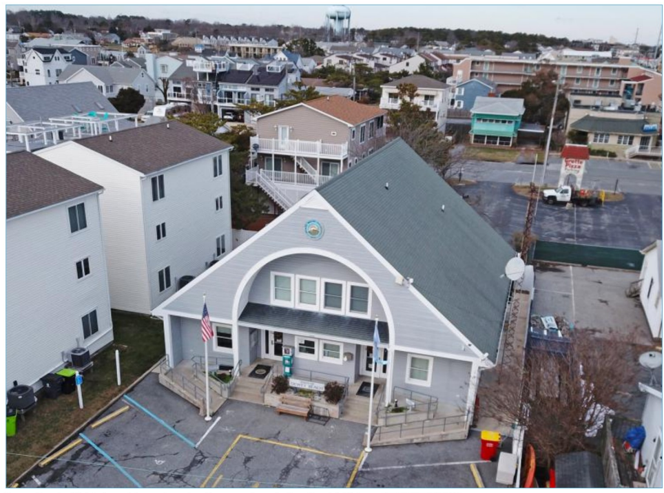
Dewey Beach officials leaned toward constructing a new town hall on Coastal Highway.

Officials seek facility double in size; current building cramped, outdated